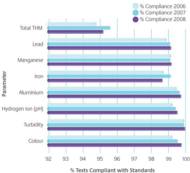
Chart 2: Water at Customers' Taps Physical & Chemical Water Quality % Compliance with Standards

In addition to measuring physical and chemical quality at customers' taps we are required to monitor specific parameters, namely turbidity and nitrite, leaving treatment works.