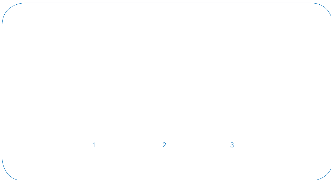
1. Lead 2. Copper 3.MDPE (Medium-density polyethylene)

Examples of supply pipes made from different materials. Lead pipe has a swollen joints compared to the others.