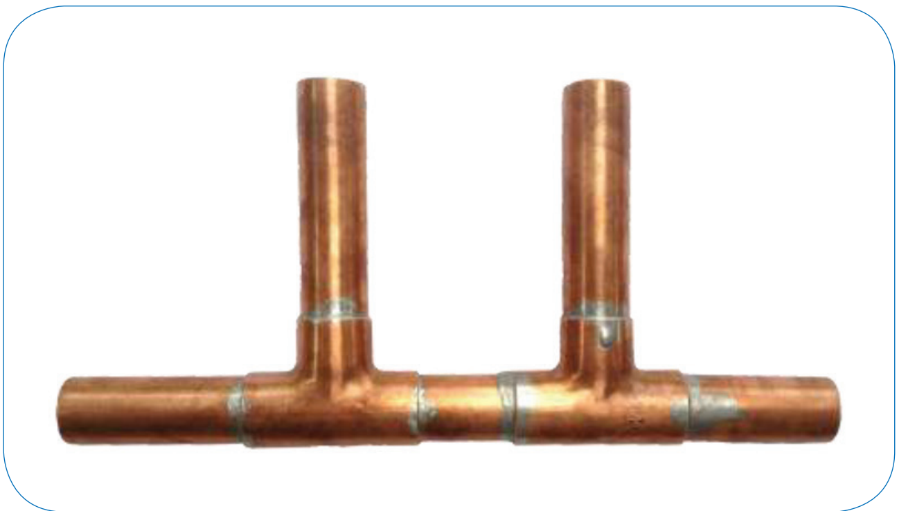
Capillary joints made with leaded and unleaded solder Can you spot the difference? See page 10

Recent use of illegal lead solder in new homes and home refurbishment has cost developers dearly to put right. Learn how you can avoid costly mistakes and protect your customers.