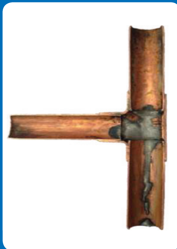
Cut-away end-feed capillary T-joint showing solder run inside the pipe

Some brass alloys used for water fittings contain a small percentage of lead (approximately 0.5 to 2%) to assist in the manufacturing of products. Practical studies showed that new brass fittings leached lead at concentrations that could contribute significantly towards total lead in drinking water at the tap. However lead concentrations fell over a few weeks.