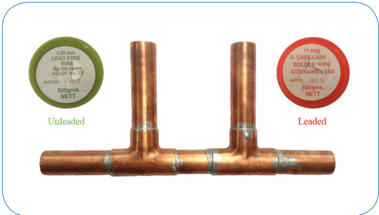
Capillary joints made with unleaded and leaded solder

It is impossible to tell the difference just from the appearance, but Scottish Water will carry out tests to show where lead solder has been used.