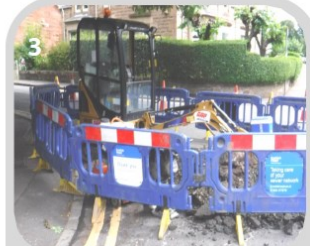
3 Excavation work begins. There may be some noise during this time