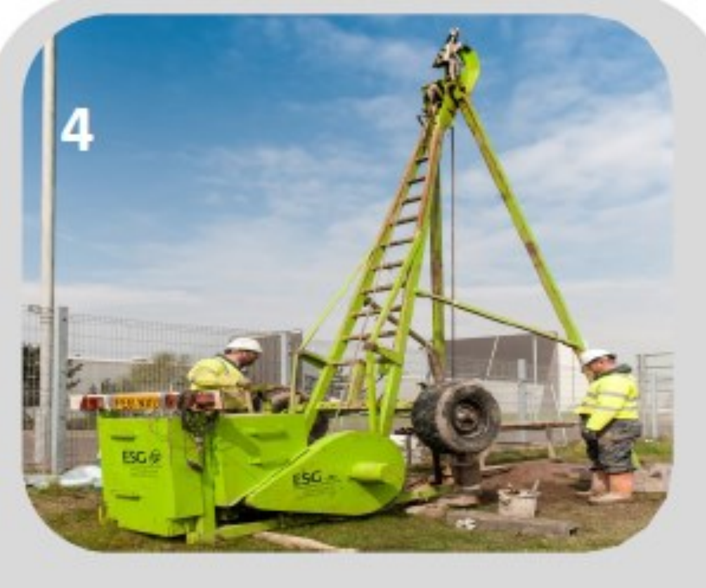
4 A borehole machine may also be needed