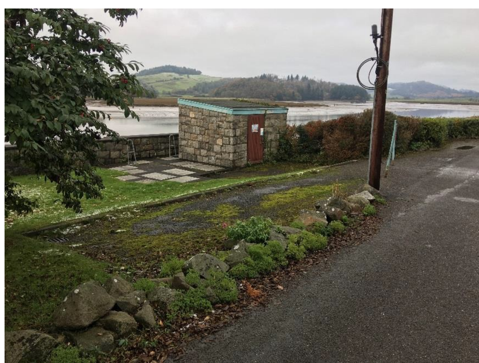
The existing septic tank on the Roughfirth Road