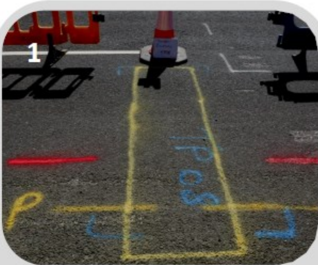
1 Area for investigation is marked up