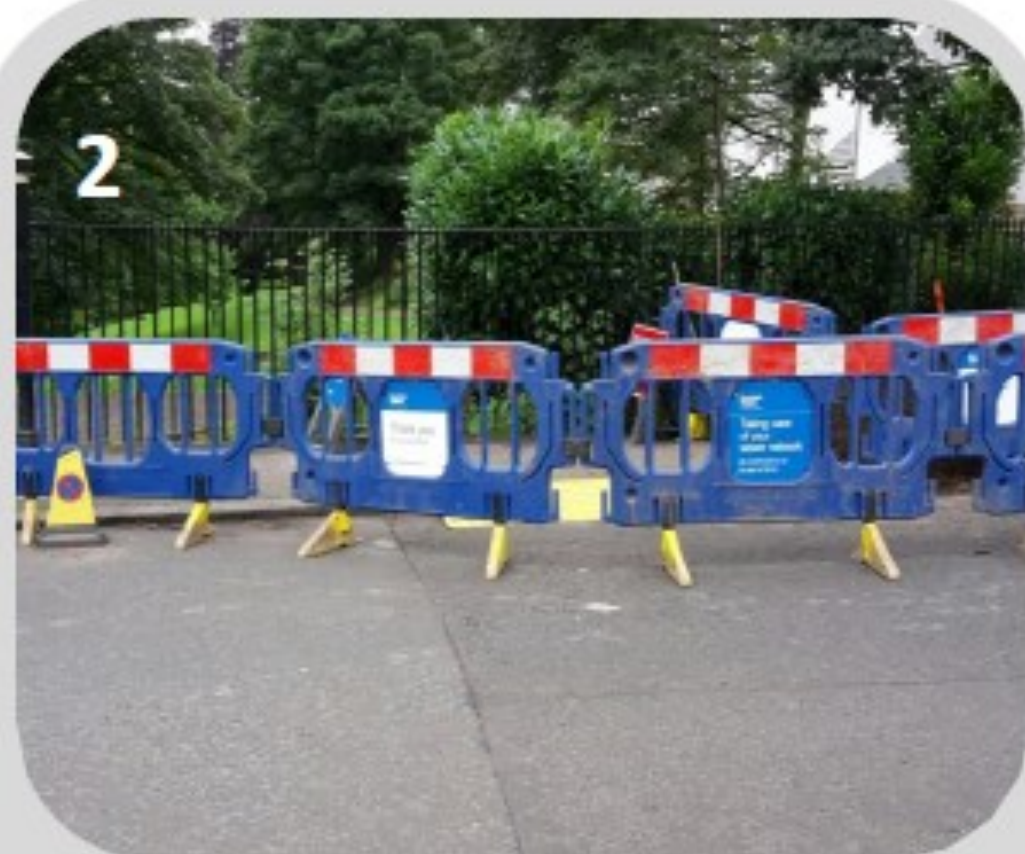
2 Pedestrian & vehicle management is set up