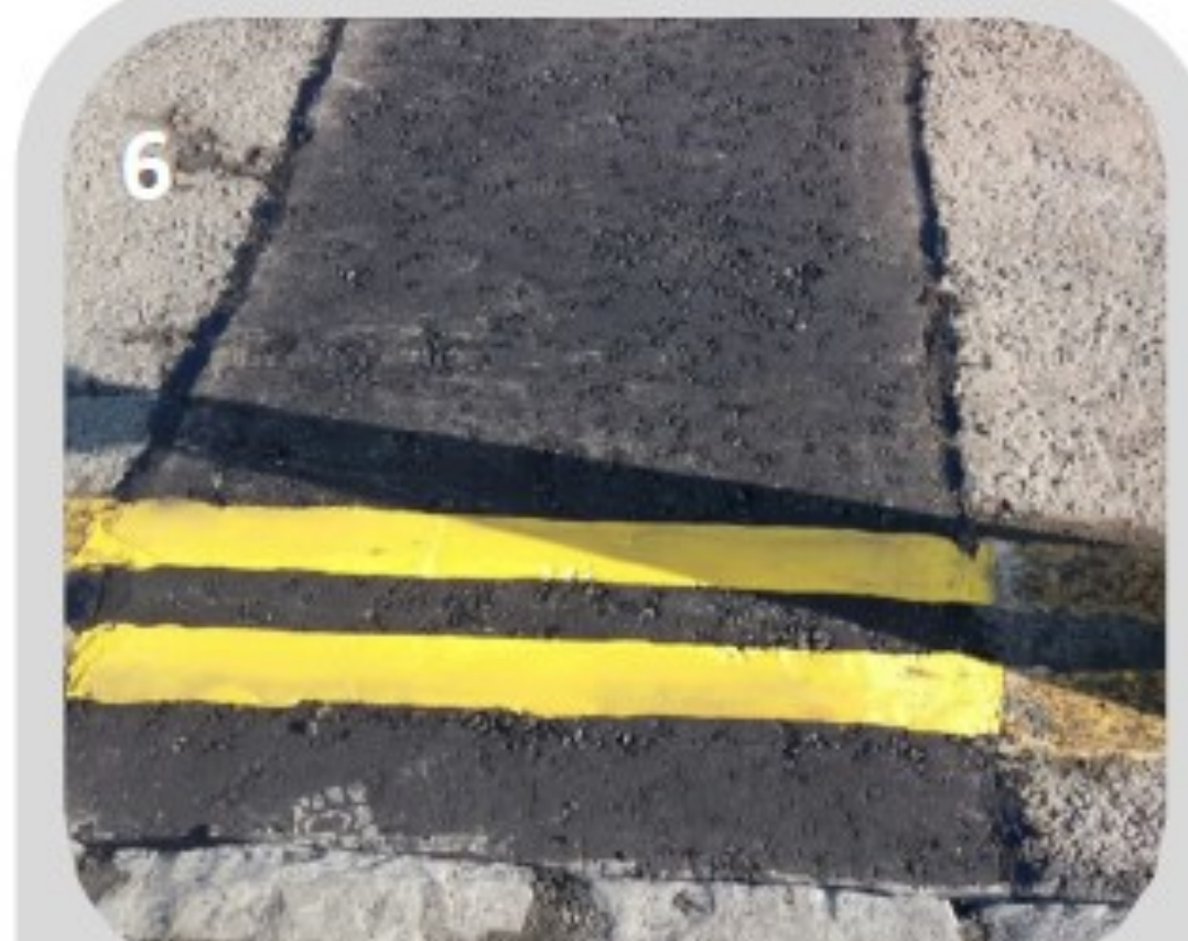
6 Reinstatement is done and site returned to normal

These will be carried out at various locations in the village and phased to minimise the impact on the community.