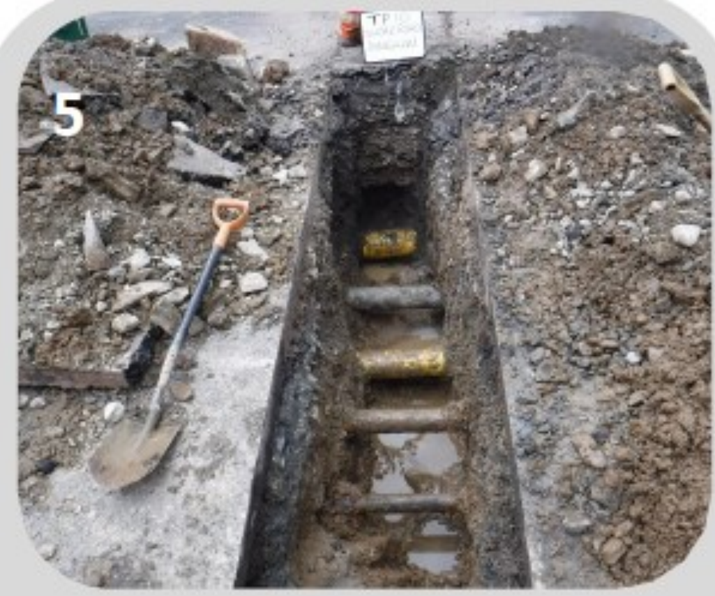
5 Investigations are carried out