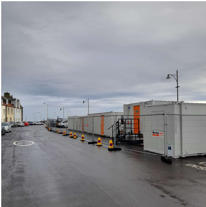
Image: Current Site Compound on Mid Shore

We are acutely aware of the impact our works are having in the harbour area. With restrictions to car parking causing disruption.