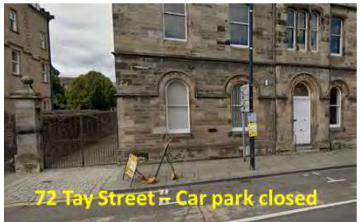
Image: Private car park at 72 Tay Street closed.