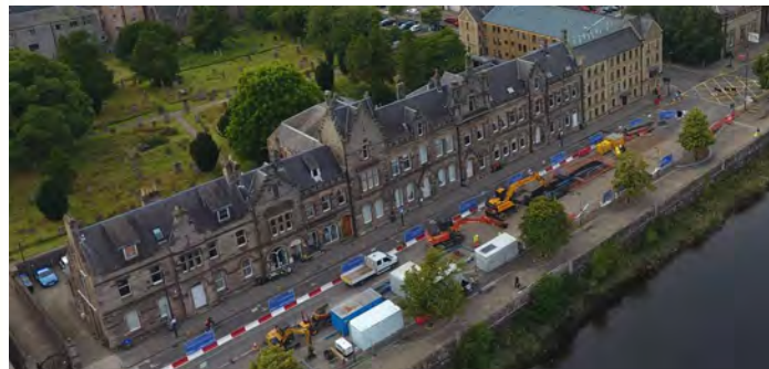
Image: Tay Street drone footage.

The next phase of work will have a direct impact as the current "running lane" in place to assist access to businesses and residents in Tay Street will not be maintained in its current form.