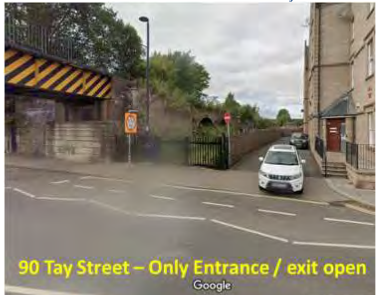
Image: Access for residents 76-78 and 90.