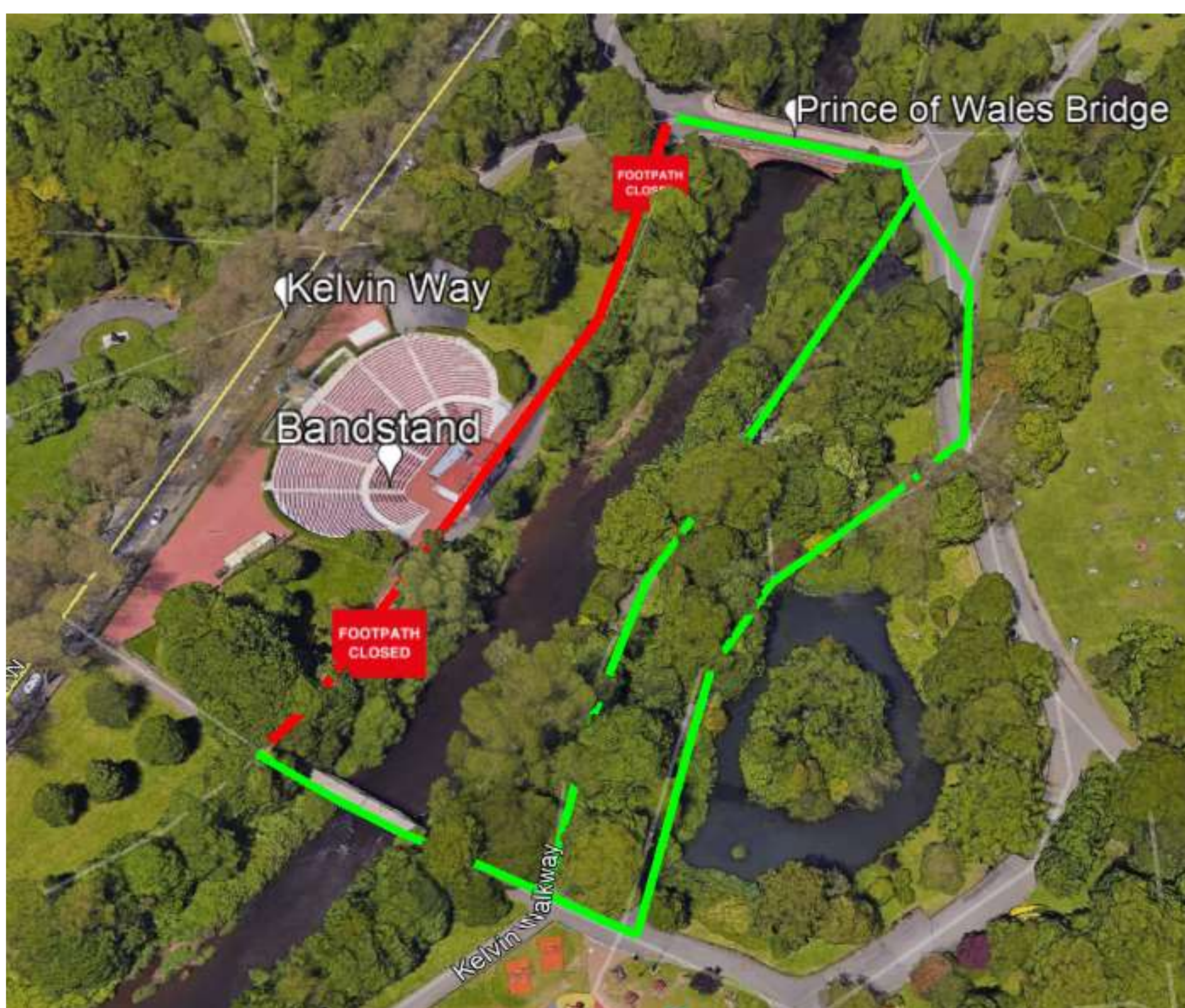
Plan of footpath closure