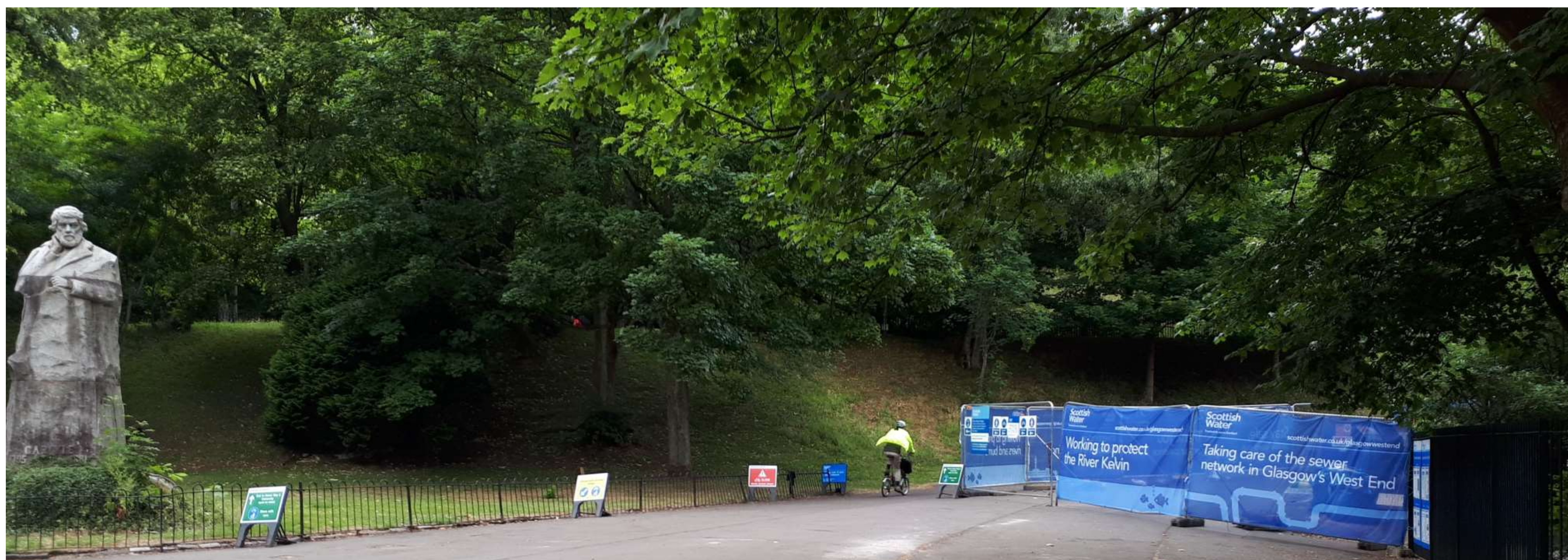
Location of site compound area near the rear entrance of the school.