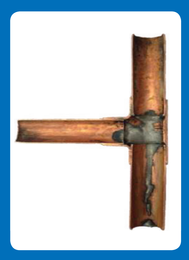
Cut-away end-feed capillary T-joint showing solder run inside the pipe

In cases where leaded solder has been used illegally, the installers risk criminal prosecution and the developers have borne the cost of replacing all the affected joints using the correct solder (see Case Study 1) 'Lead-free' solder should comply with the composition of Alloy Number 401 described in BS EN ISO 9453:2014, containing no more than 0.07% lead by weight. This is being sold under alternative names such as "99C Lead free solder wire" or leadfree number 23 tin/copper alloy soft solder, referring to now-withdrawn standards. More information is given in the WRAS Leaflet No. 9-04-02 "Solders and Fluxes "1" which can be downloaded free from the WRAS website.