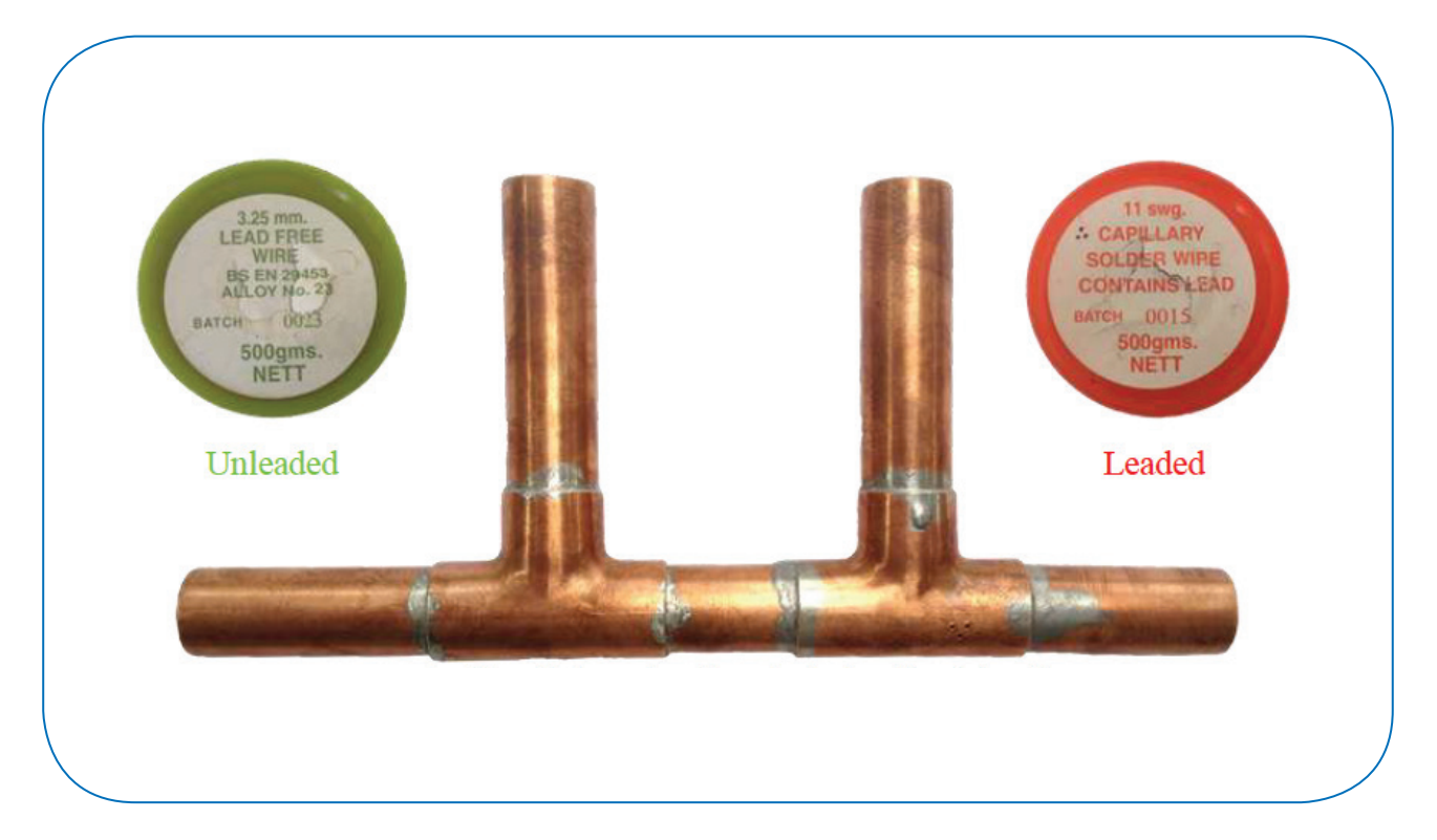
Capillary joints made with unleaded and leaded solder

It is impossible to tell the difference just from the appearance, but Scottish Water will carry out tests to show where lead solder has been used.