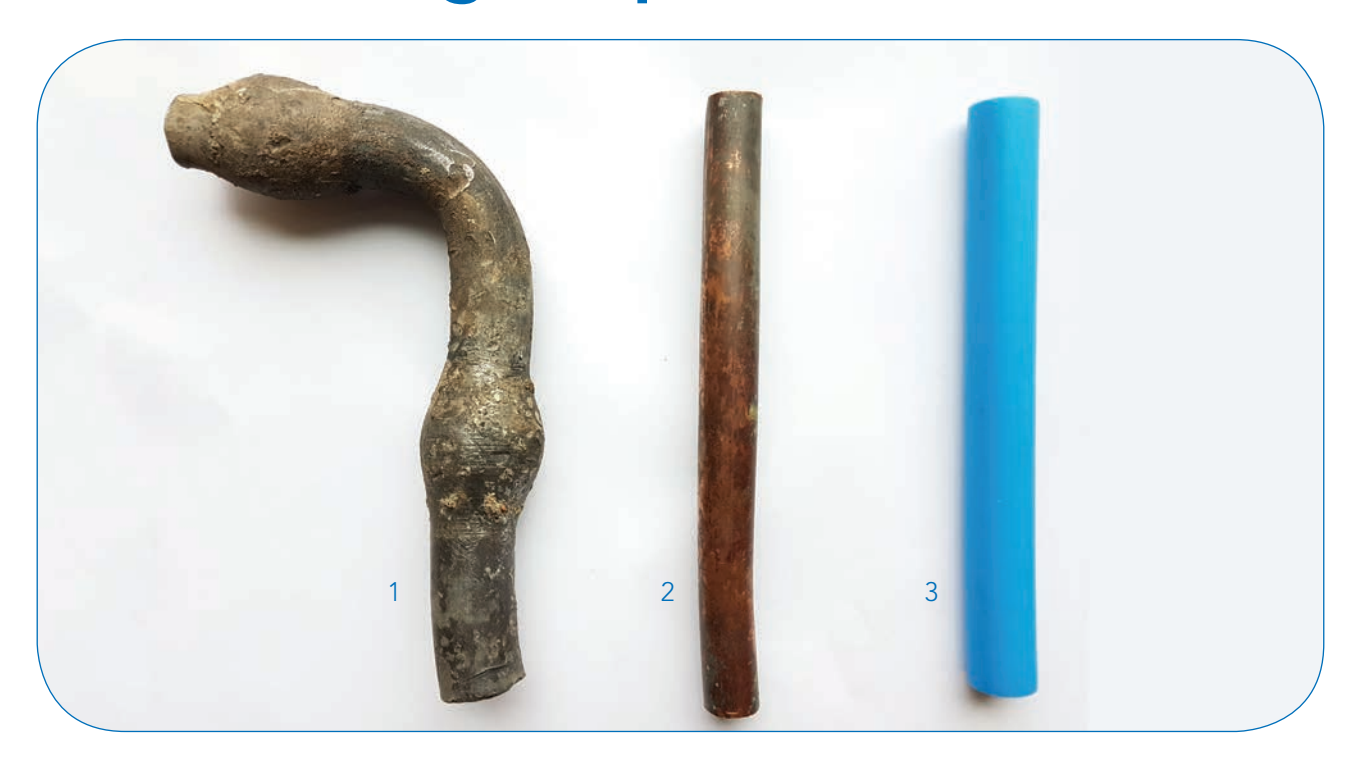
1. Lead 2. Copper 3.MDPE (Medium-density polyethylene)

Examples of supply pipes made from different materials. Lead pipe has a swollen joints compared to the others.