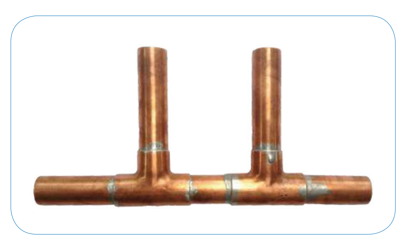
Capillary joints made with leaded and unleaded solder Can you spot the difference? See page 10

Recent use of illegal lead solder in new homes and home refurbishment has cost developers dearly to put right. Learn how you can avoid costly mistakes and protect your customers.