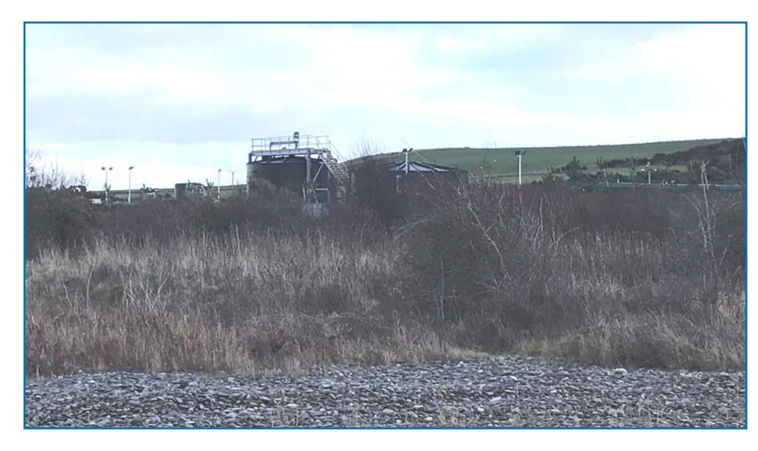
Photos showing Picket Fence Thickener tank as currently installed, before proposed reduction in height. Above: from the north on the coastal path. Below: from the north on the B9006.

A folding handrail would be used on the access gantry (indicated below in red) which would only be in the upright position for infrequent access by operators.