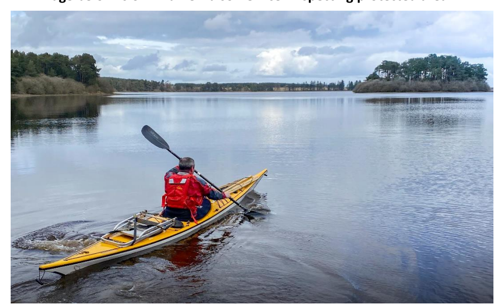
Image below is of Wildlife Liaison Officer inspecting protected area.

We worked closely with the police wildlife liaison officer to design refreshed signage for the island where the Schedule 1 birds come to breed around mid to late March. We are happy to report that they raised chicks this summer and experienced no disturbance from visitors.