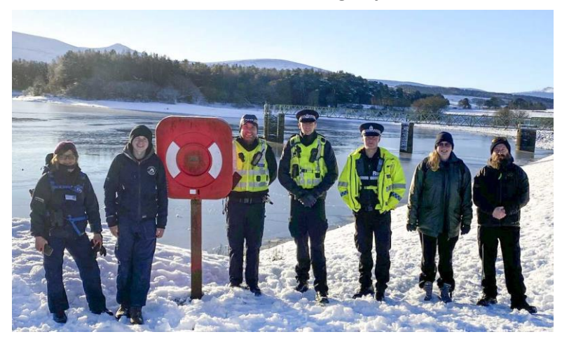
Harlaw Reservoir training day

Last winter also brought with it two distinct cold snaps where the reservoir iced over making an already dangerous environment a much more daunting prospect. To this end SW instated signage warning of the dangers of ice and Elspeth undertook ice safety training and engaged with visitors about the potential hazards. We are happy to report no known untoward ice-related incidents at Gladhouse at the time of writing.